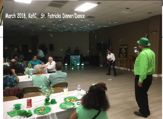
March 2018, KofC, St. Patricks Dinner/Dance